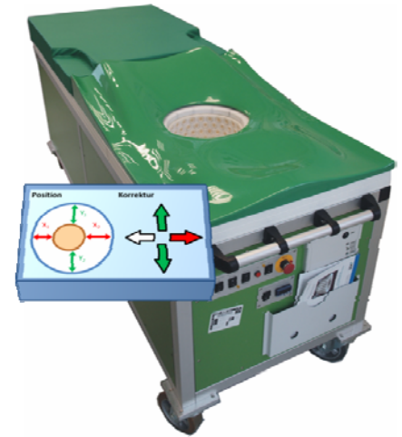
Fig.1: 3DUSCT II imaging system

At KIT a novel imaging method, called 3DUSCTII, is under development. In this method ultrasound signals are used (A-Scans, ultrasound pressure over time) to reconstruct 3D image volumes of the female breast for early breast cancer diagnosis. For a demonstrator 157 ultrasound transducer array systems (so called TAS, see Fig. 2) were designed and built. The transducers act as receiver or emitter and are positioned around a measurement container (see Fig.1, centre in the patient bed). The used transducers have typically a centre frequency of 2.5 MHz and the USCT method uses therefore water as contact medium. In the USCT system are two calibrated PT100 temperature sensors and one integrated low accuracy temperature sensor per TAS, providing two sources of temperature with varying spatial and temporal resolution and quality.